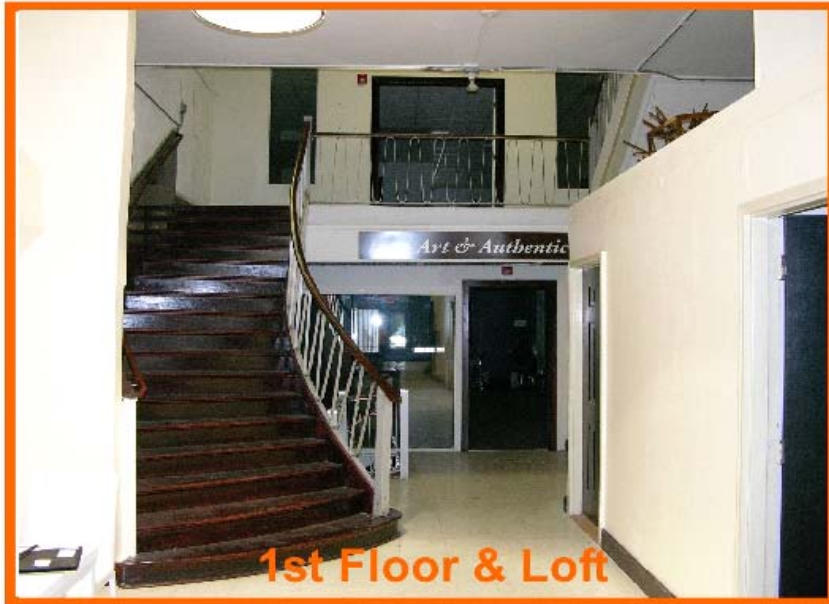
1st Floor & Loft