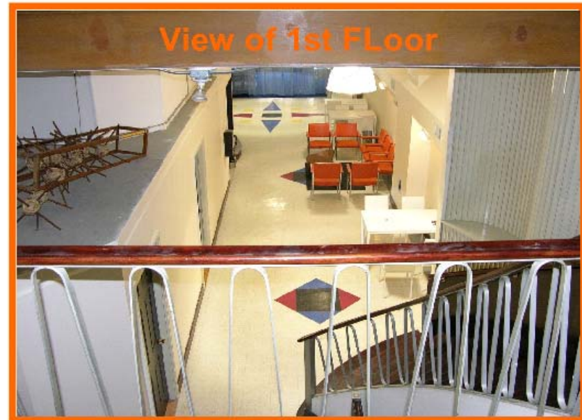
View of 1st Floor